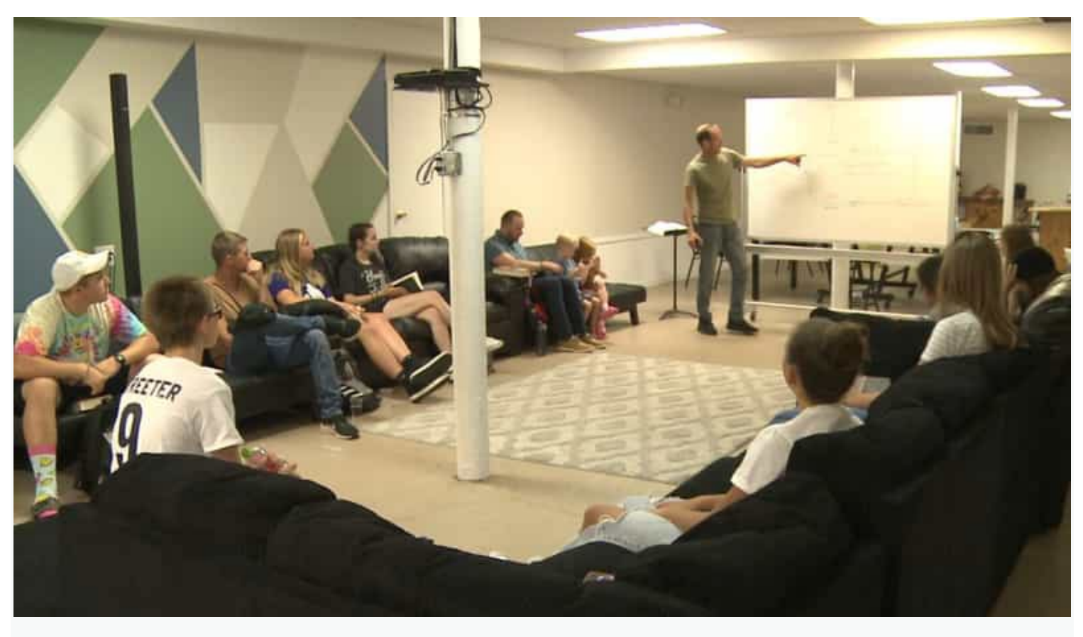
What it's Like to Live in Amsterdam, NY:

Amsterdam, NY is an up and coming community with growth potential that is not yet fully recognized. Local government is making efforts/strides to offer many different events/venues to get the community engaged. Riverlink Park, Ice skating rink at Veteran's field, Amsterdam Mohawks baseball team, festivals, etc are all examples of unique opportunities offered to folks within the area. There are also great opportunities for families to attend concerts at the historic Mohawk Valley Gateway Overlook perfect for those looking to enjoy some family-friendly fun plus nearby Indian Ladder Farmstead provides stunning views ideal for outdoor activities. Additionally, there are several locally owned stores and eateries providing unique items or delicious cuisine great for any budget. Amsterdam is very conveniently located to a lot of other great areas such as downtown Albany, Saratoga, foothills of the Adirondack mountains, etc.