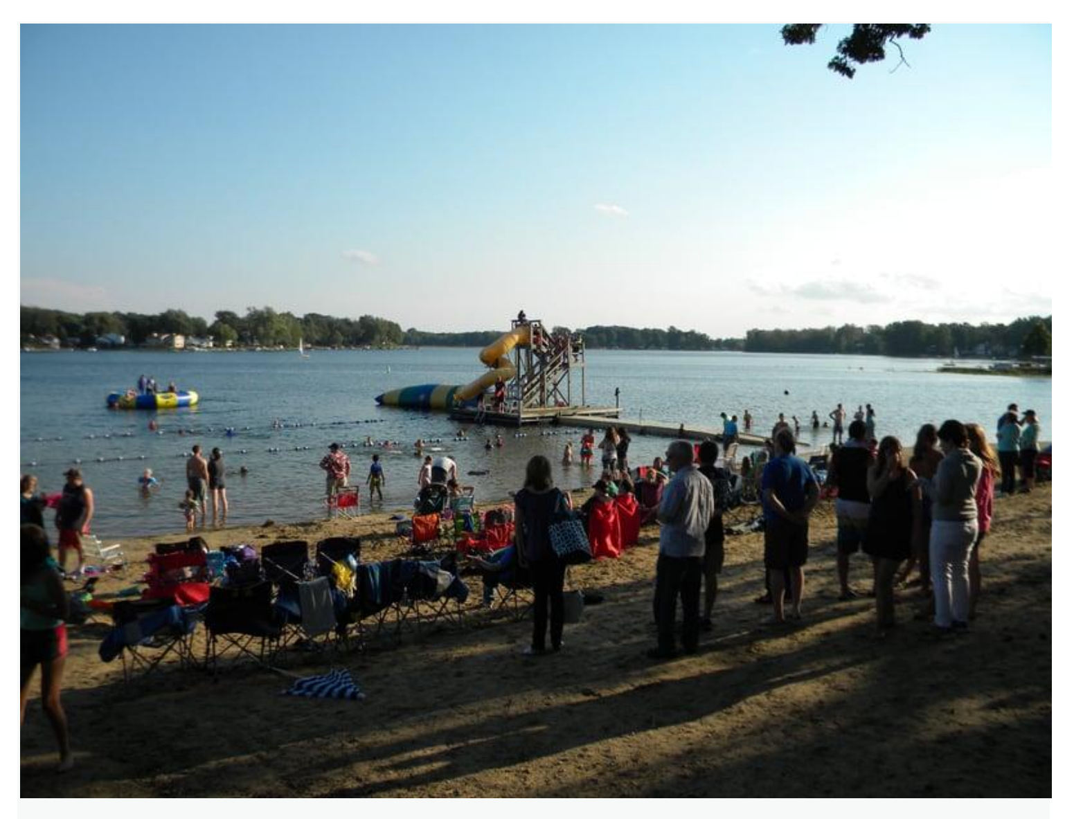
What it's Like to Live in Portage, MI: