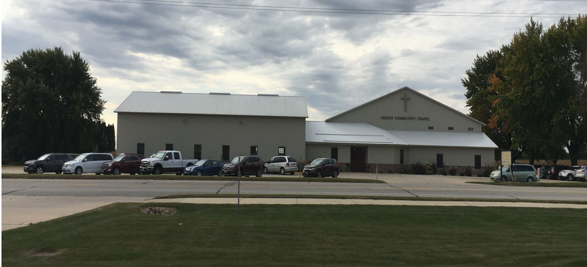
Cresco Community Chapel, 2 Oct 2022

AFFILIATION: Non-denominational Bible church CONTACT: crescocommunitychapel.org 563-547-4343 24024 Highway 9 East, Cresco, IA 52136