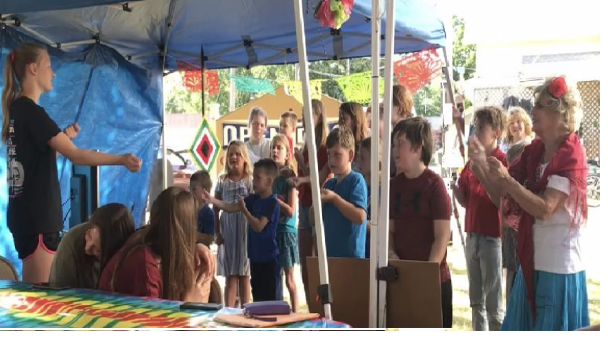
Tuesday Lunch Bunch 2022